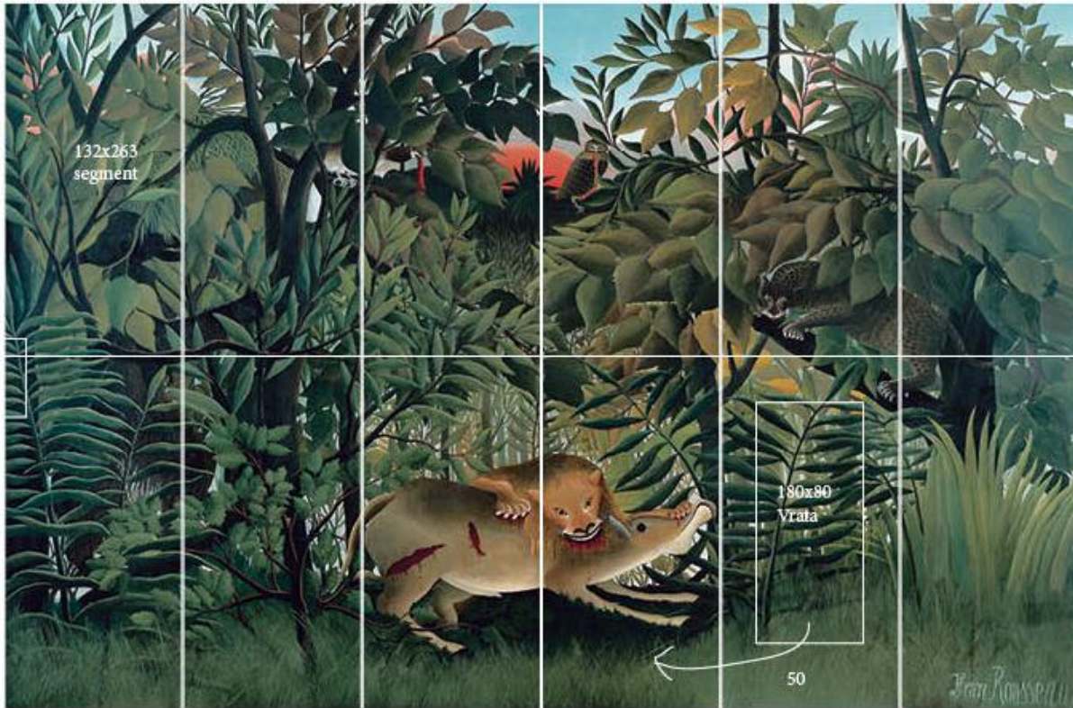
Figure 1: Set design (front view)